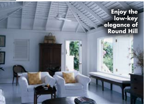
Enjoy the low-key elegance of Round Hill