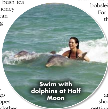
Swim with dolphins at Half Moon

For the more adventurous there's zip-lining through the rainforest at Mystic Mountain, or hiking up the slippery boulders to reach the top of the Dunn's River Falls, a cascading waterfall that drops 600ft. It gets very busy so it's best go early or late and remember to wear shoes you don't mind getting soaked!