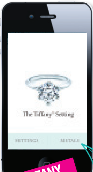
TIFFANY & CO

W inner of the prestigious BIMA Award for Best Use of Mobile, this beautifully designed app is updatable online or on the go. The main planner breaks down the essentials; from the invites to lingerie, with Amanda's personal advice on everything! For each category you can take and add pictures, save links, record contacts, make appointments and share info online.