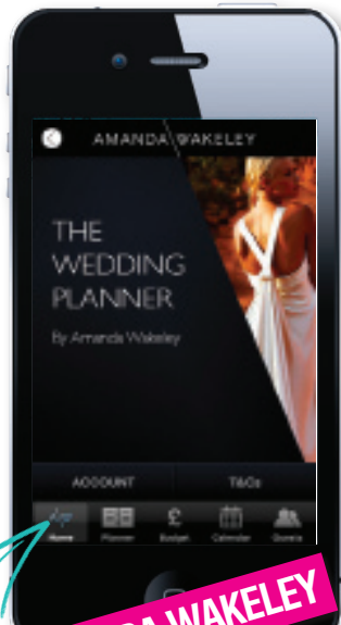
AMANDA WAKELEY WEDDING PLANNER

Plan your big day on the move with these handy apps and blogs... Words: Rowena Carr-Allinson